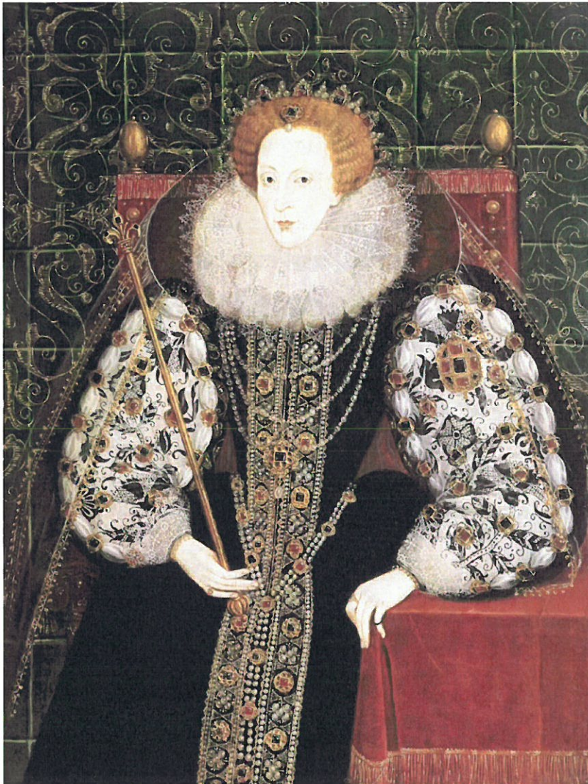
2. Unknown Artist (British School), Elizabeth I of England , c. 1585–90, oil on panel, 119.4 × 91.4 cm, National Maritime Museum, Greenwich