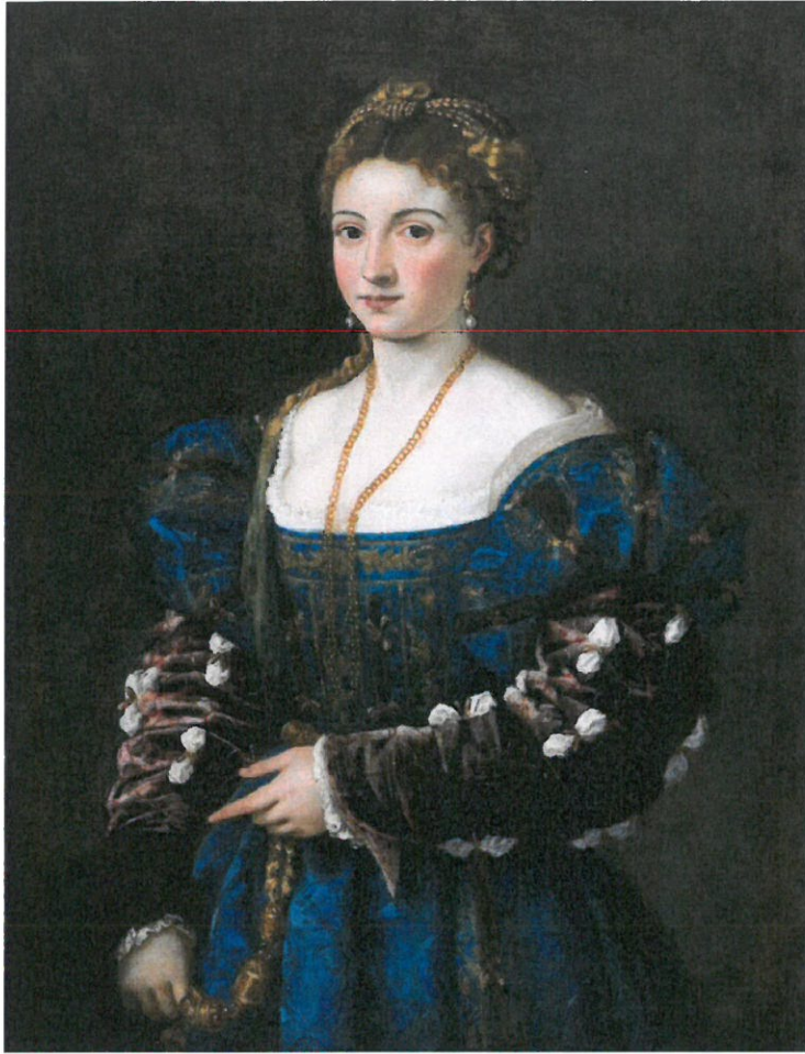
3. Titian (Tiziano Vecellio), La Bella , c. 1535, oil on canvas, 100 × 75 cm, Palazzo Pitti, Florence

四、Mention a favorite artwork or monument you like and solve the following tasks (10 pts in total):